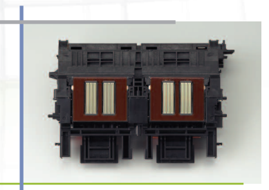
Dual Print-Head System

The imagePROGRAF iPF9000 features a newly developed, 12-color pigment ink system designed to expand the color reproduction range by providing an extremely wide color gamut for vivid accurate colors and fine precise details. The expanded color gamut produces brilliant colors to more accurately match a broader spectrum of colors. The two levels of gray provide a perfectly neutral monotone output that surpasses expectations. Also, the utilization of automatic switching between regular black and matte black eliminates the wasted ink and time spent swapping out ink tanks. The combinations of these 12 inks produce exquisite results.